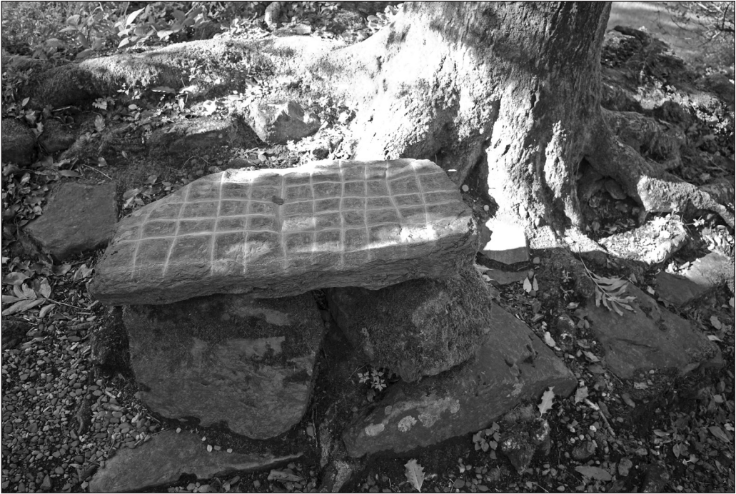
Plate 2: Old Altar Atone at Guagán Barra

1.8m by 1.5m is mounted on top of a level outcropping of rock to form an altar approximately 1m in height. A number of stones remain on the ground in close proximity to the Mass Rock which Ryan believes were used by the congregation during Mass (Ryan 1957, 26). The site is located about 70m south of the old Butter Path and would have been accessible from Coolmountain and the Keakill valley. There are other extant trackways in the area leading from Togher and Derrinacaregh (Miller 2009). Father Ryan records two Mass Rocks in the Coolmountain region; Toureen and Tullough (Ryan 1957, 26). Miller believes that Shehy Beg is possibly the Toureen Mass Rock site mentioned by both McCarthy (1989) and Ryan (1957) given its close proximity to the townland of Toureen and an absence of local knowledge in respect to any other site within the townland itself (Tony Miller, pers. comm. 26 August 2012). However, it is plausible that the Coolmountain site discussed below may be the 'Toureen' Mass Rock discussed by Ryan (1957) given its location close to the road which leads to the townland of Toureen. It is possible that there were in fact three Mass Rock sites in the Coolmountain region.