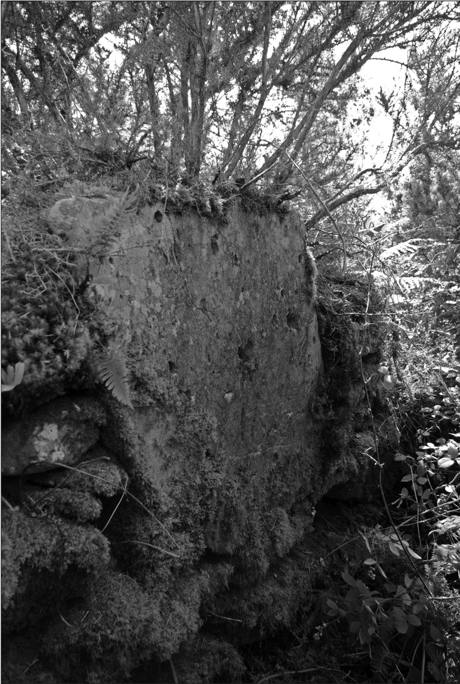
Plate 8: Date Stone at Ruined Penal chapel, Currahy