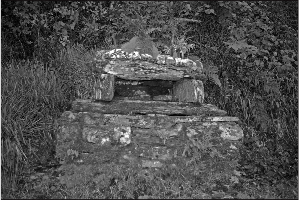
Plate 1: Curraheen Mass Rock

1842 (Ryan 1957, 27). The veneration for crucifixes, particularly Penal crosses, has remained a feature of Catholic tradition at pilgrimage sites (O Broin 1925, 110) and Ó Duinn argues that these small wooden crucifixes of the eighteenth and early nineteenth century must have played a singularly important part in the religious life of the people during the Penal era (Ó Duinn 2000, 119). A modern day 'Penal cross' had been placed in the reredos at the Curraheen Mass Rock and a number of other 'votive' offerings had been left at the site including a metal crucifix and flowers in a vase.