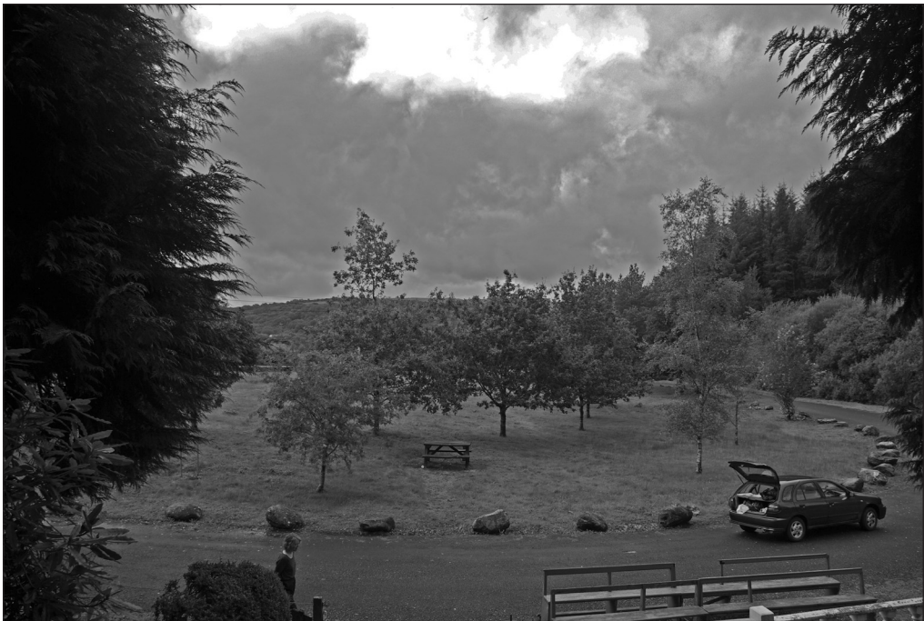
Plate 7: Site of Rossmore Penal Chapel