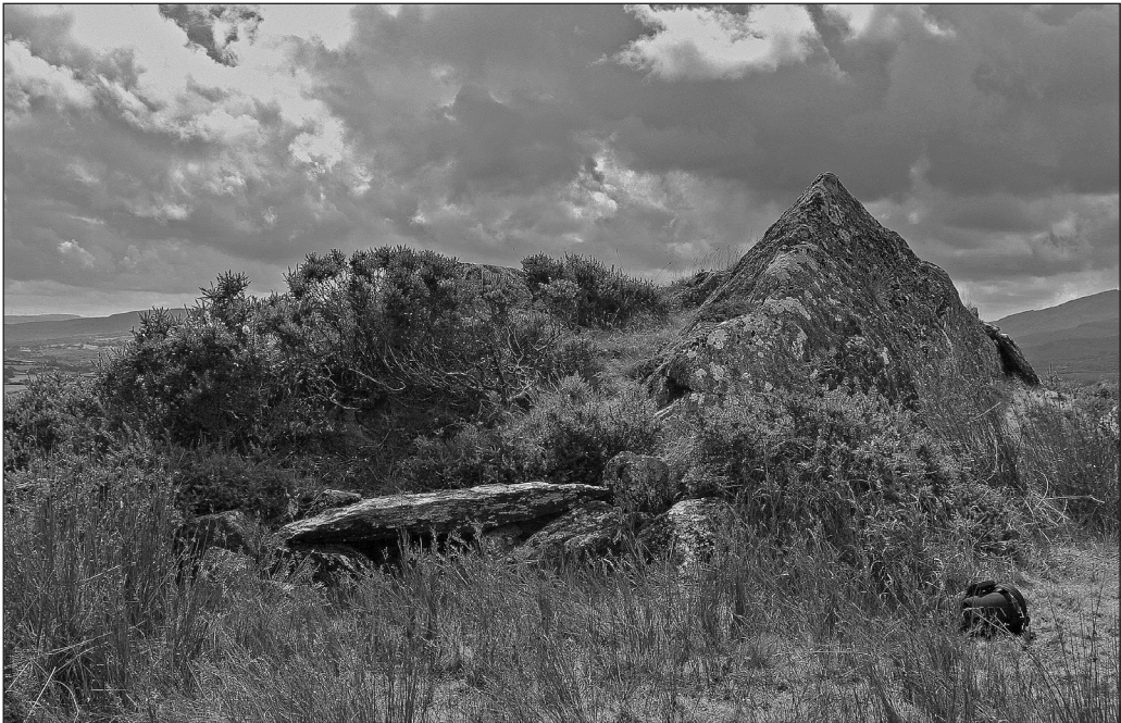
Plate 6: Carraig an tSeipeil Mass Rock

The shape of the Gourtnahoughtee Mass Rock in Uíbh Laoghaire would have made it a well-known topographical feature locally (Pl. 6). Identified by McCarthy (1989) as ' Carraig an tSeipeil ' and described by Father Ryan (1957) as a 'little chapel', it is located on