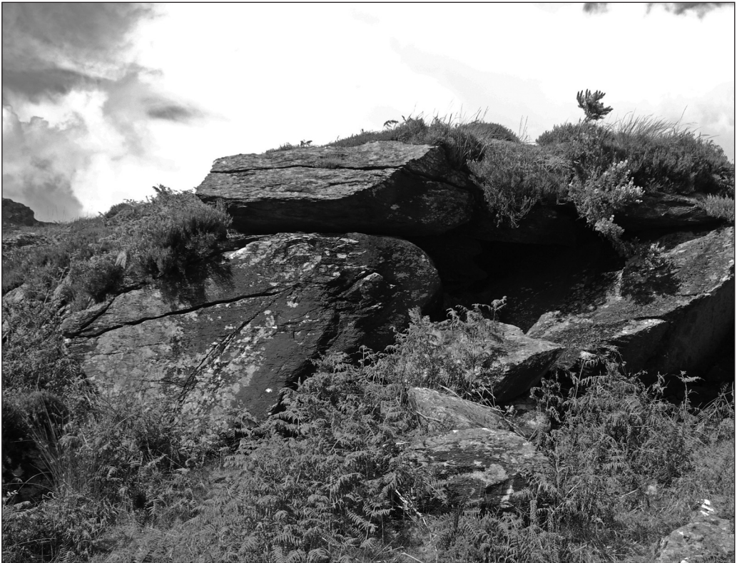
Plate 5: Priest's cave at Ballingeary, Cum an tSagairt , Mass Rock site

Depressions in stone, both naturally occurring and manmade, appear to be a feature at other Mass Rock sites in Cork including Heir Island and Kilmore in Uíbh Laoghaire . The Kilmore Mass Rock lies just to the north of a possible early ecclesiastical enclosure, burial ground and souterrain in the townland of Kilmore and consists of a large slab of rock measuring approximately 3.15m by 2.3m which sits on top of another similarly sized slab. There