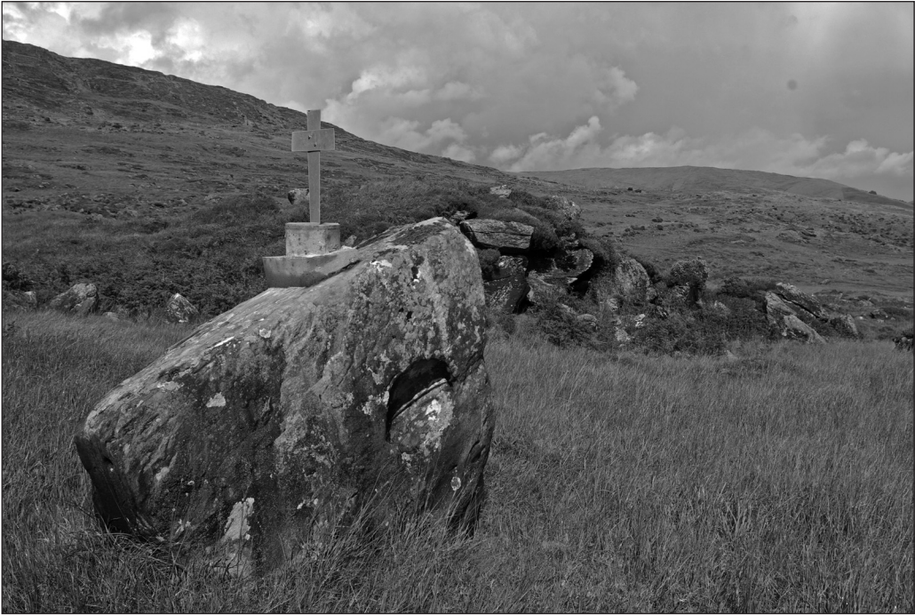
Plate 4: Cum an tSagairt Mass Rock

almost contiguous presence from prehistoric times to the present day (Ní Cheallaigh 2012, 369). More than most other archaeological monuments, Ní Cheallaigh believes that ringforts have 'lain at the intersection of diverging worlds of symbolic imaginings that encompass a wide variety of interacting social and cultural identities' in Ireland (Ní Cheallaigh 2006, 105). In county Mayo, Aldridge identified that burial grounds were often located both inside and outside a number of ringforts (Aldridge 1969, 83–85). The Drombeg Mass Rock, near Clonakilty in county Cork, is located within a ringfort and the tradition of a burial ground in pasture adjoining the west side of the ringfort was highlighted by the landowner (landowner, pers. comm. 20 April 2011). O'Sullivan and Sheehan identify that quartzite pebbles are often found associated with such burial sites (O'Sullivan and Sheehan 1996). They were also found during excavation of the Toormoor wedge tomb (O'Brien et al. 1989/90), near Schull, which was subsequently re-used as a Mass Rock during Penal times (site notice) and in association with Mass Rocks in Cork, such as Calloras Oughter and Curraheen in Uíbh Laoghaire (Bishop 2015).