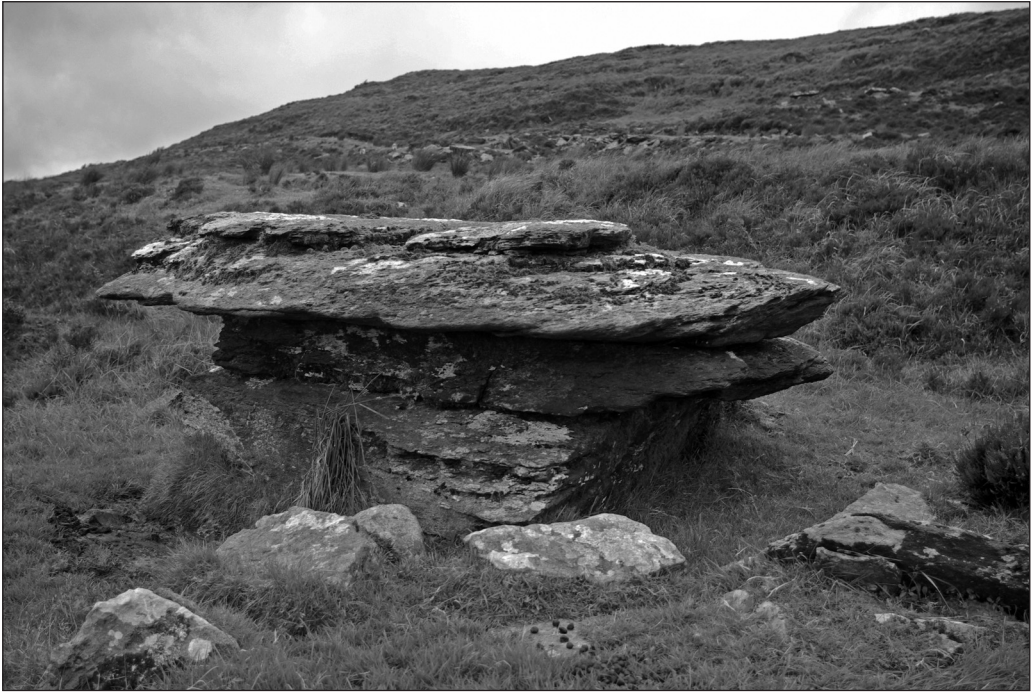
Plate 3: Shehy Beg Mass Rock

removed so that a chamber-like space has been created similar to the reredos at Curraheen. At the time of the visit the site was heavily overgrown with scrub.