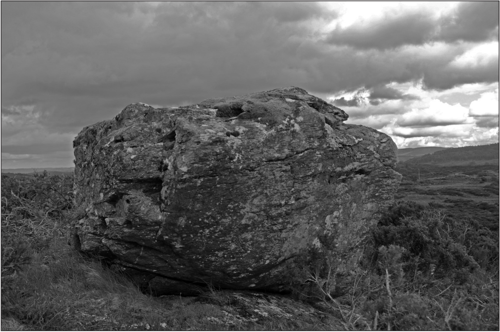
Plate 9: Currahy Mass Rock